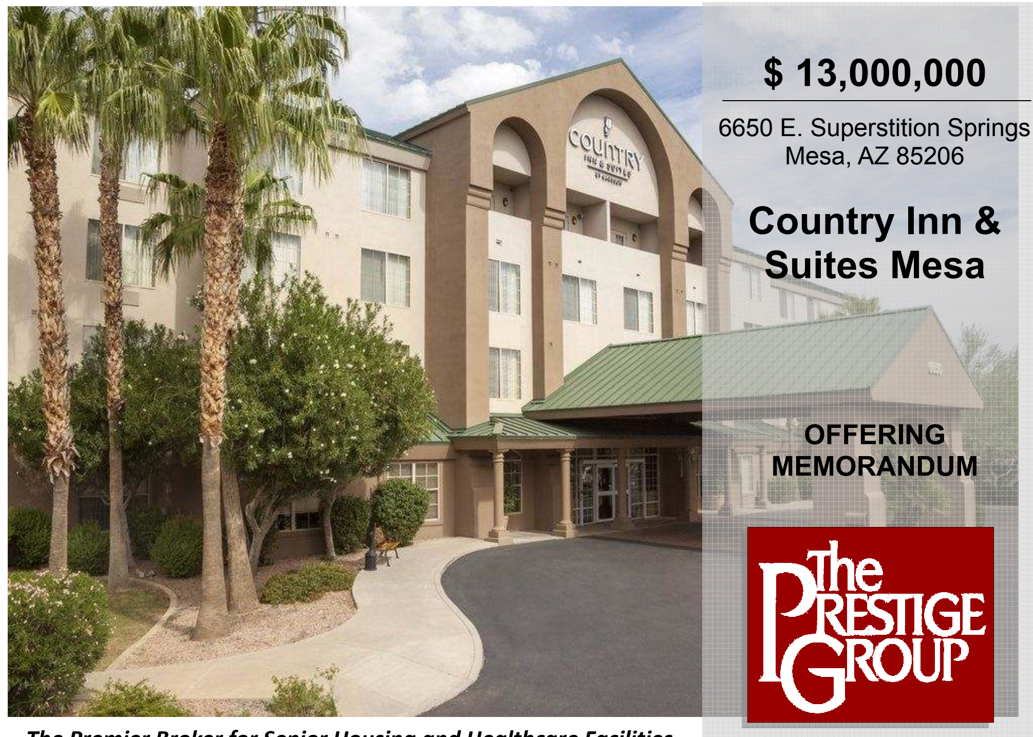
The Premier Broker for Senior Housing and Healthcare Facilities www.PrestigeGroupSeniorHousing.com www.PrestigeGroup.com